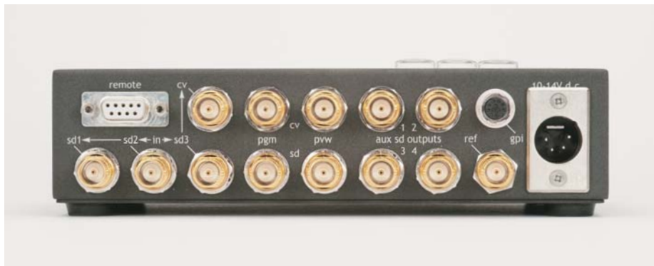
Callisto Micro: Rear view